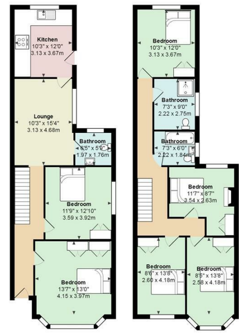
Malefant Street, Cathays.

Total Area: 1533 ft 2 ... 142.4 m 2 All measurements are approximate and for display purposes only